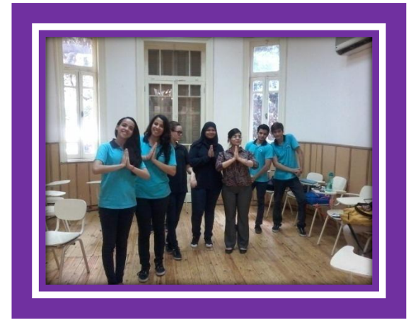
We'll talk out your worries at the Psychology club